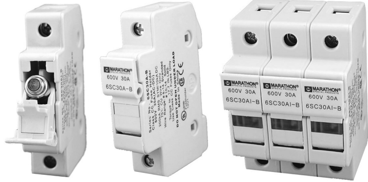
6SC30A1-B shown with fuse (fuse not included)